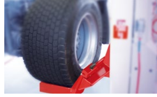
Lifting fork of 14" is well suited for super single tires.