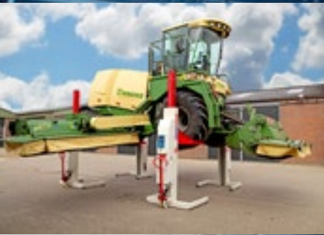
MOBILE COLUMN LIFT

STERIL SUPERIOR SOLUTIONS BY QUALITY PEOPLE